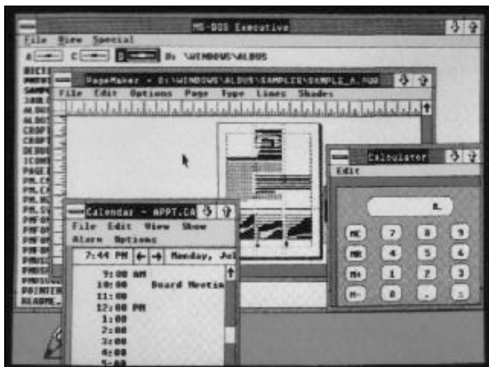
Figure 2. Microsoft Windows 2.0

being built into the sale of 8-bit machines. The fading CP/M operating system and the popular MS-DOS operating system were now making way for new developed by Microsoft and IBM on the IBM PC platform. (Necasek, 2004)