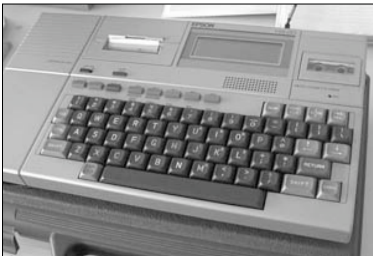
Figure 1. The Epson HX-20 microcomputer

Furthermore computers such as these also had support for light pen technology which would assist people with mobility issues. Furthermore, machines such as the Apple II were cheaper and already had a significantly larger user base than the Epson HX-20. (Gergen, 1986)